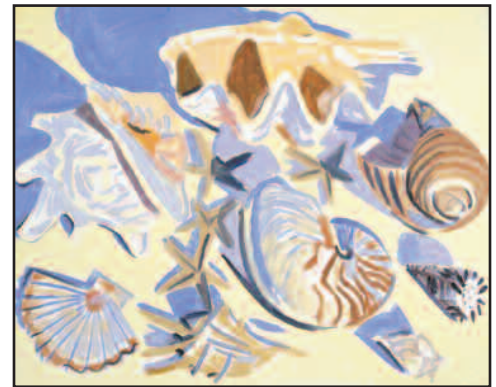
Shell Still Life, 2004, 16" x 20", oil on canvas

"In my work, I often use watercolor as a starting point," comments Fowler. "I draw from nature, from photographs, and from my imagination. This gives me something to look at as I work in different media and different sizes. If possible I transpose the watercolor compositions to oil without changing the feel or structure of the original. I like the oil paintings